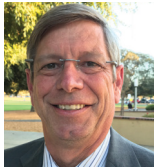
Glen Hendricks City of Sunnyvale, Council Member, Seat 2