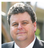
Mark Burns State Board of Equalization, District 2