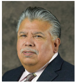
Bob Nunez City of Milpitas, Mayor