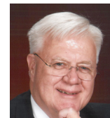
Burt Lancaster 27th Assembly District