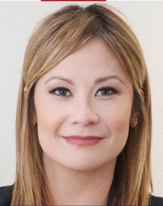
STATE SENATOR LING LING CHANG