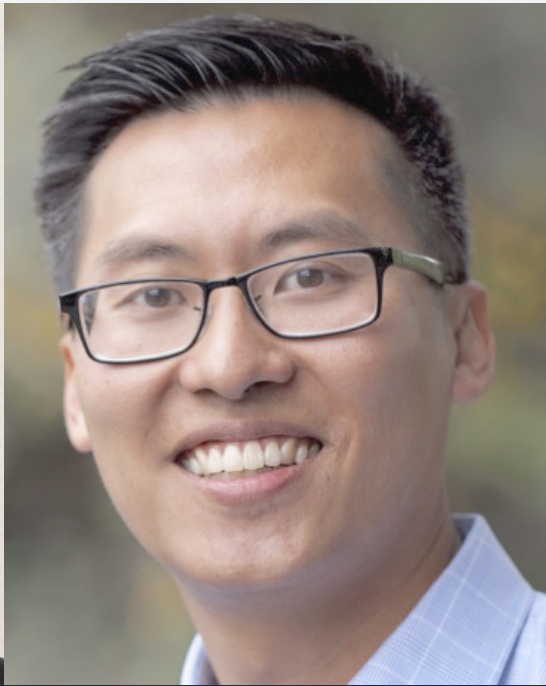
STATE ASSEMBLY MINORITY WHIP VINCE FONG